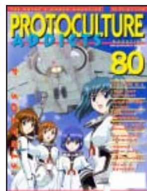
Not Actual Cover

This magazine offers no glossy, oversized color pages, but only useful information condensed in an affordable format . Each page is packed, not with color illustrations, but with a thousand words telling anime & manga fans what they really need to know. Design for those who want substance and to whom content matters over look, Protoculture Addicts is definitely your best guide to anime culture! This issue offers spotlights on the second season of THE BIG O (Bandai will release the first DVD volume in December) and on THE CAT RETURNS (the latest movie from studio Ghibli, which develops further the "Baron" character from Whispers Of The Heart ). It also features several "Anime Stories", introducing new anime series like Ashita no Nadja , Looking For The Full Moon , Monkey Typhoon (aka Assobot Goku ), Nurse Witch Komugi-chan , Raimuiro Senkitan , Stratos 4 , Tokyo Mew Mew , and much more!! Finally, it includes the usual "Anime World" articles (convention & festival reports, The Modern Japanese Music Database Part 24, etc.), the reviews of lots of recent anime & manga-related products (DVDs, CDs, manga, books, model kits, live-action movies, etc.) and the latest news. Don't miss it! Ships in January.